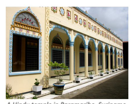
A Hindu temple in Paramaribo, Suriname.

Following the end of the Transatlantic Slave Trade, hundreds of thousands of Hindus from India andNepal were taken to British colonies such as Guyana, Jamaica, and Trinidad & Tobago. The British also brought Hindus to Suriname, which was under Dutch rule. The primary roles for the indentured servants was to work on the sugar fields. Many were also exploited, particularly women, as they were used as mistresses for British colonial administrators. Hindus were also taken to countries such as Barbados, the Virgin Islands, and Belize, though their numbers were far smaller. Due to aggressive proselytization