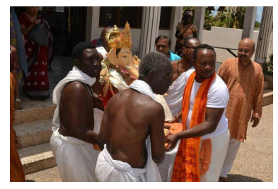
Hindus in Ghana celebrating the Hindu holiday, Ganesh Chaturti.

Hinduism came in waves to Africa, with Southern Africa getting Hindu workers during the early years of British colonization, while East and West Africa experienced Hindu migration during the 20th century. South African Hindus played a significant role in the struggle against Apartheid, with figures such as Monty Naicker becoming leaders in the national struggle against minority white rule. Today, the Hindu community remains a strong presence in major cities such as Johannesburg, Cape Town and Durban. Hinduism is the majority religion in Mauritius. In Ghana, it is one of the fastest growing