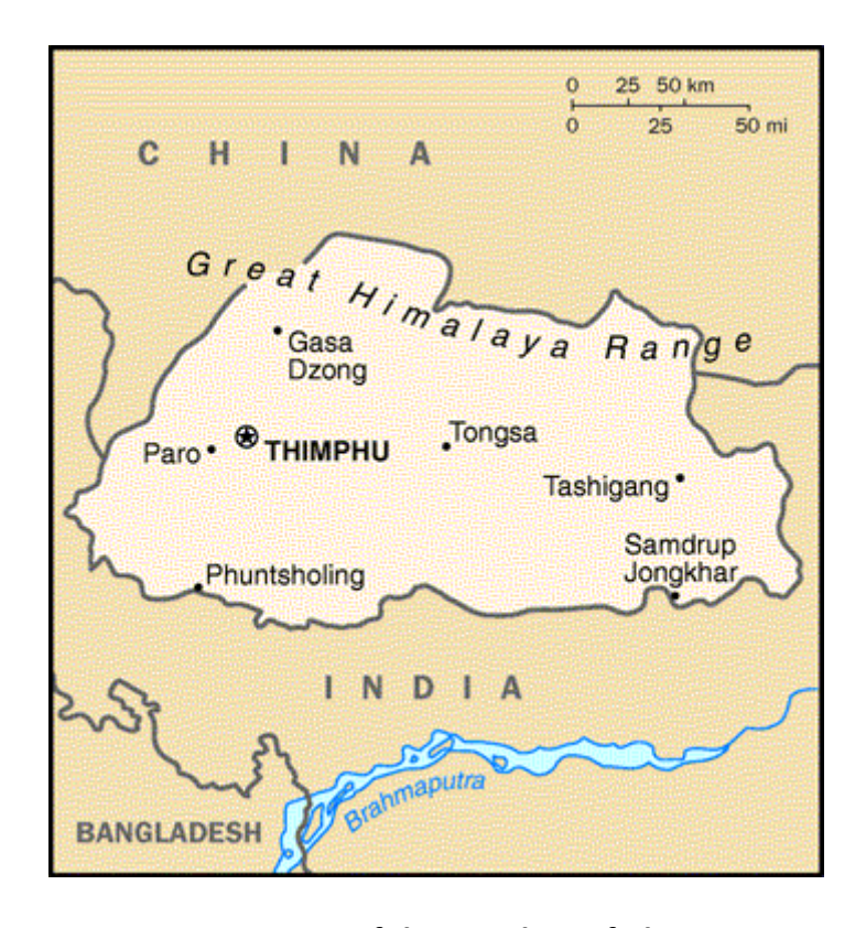
Figure 3: Map of the Kingdom of Bhutan