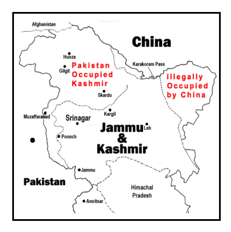
Figure 5: Map of Jammu and Kashmir region

lxxxiii