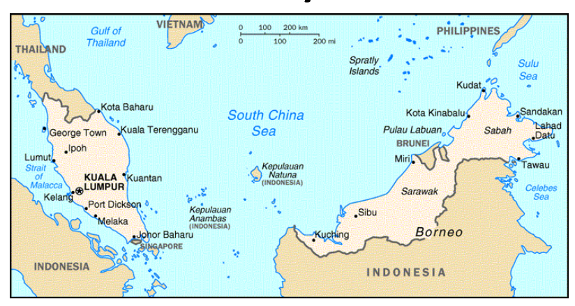
Figure 7: Map of Malaysia