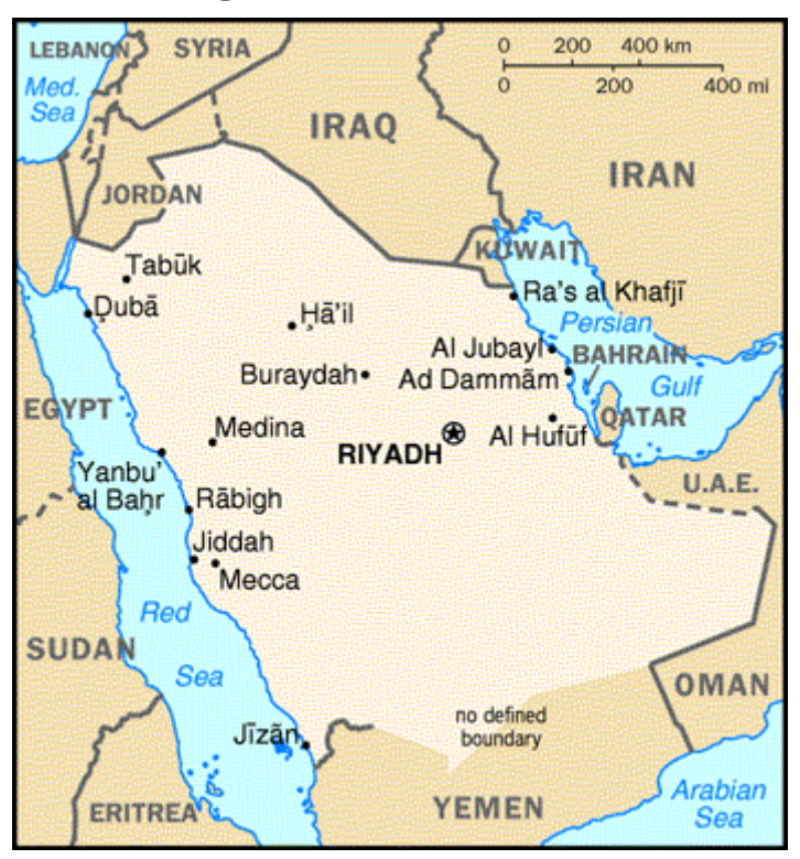
Figure 9: Map of the Kingdom of Saudi Arabia