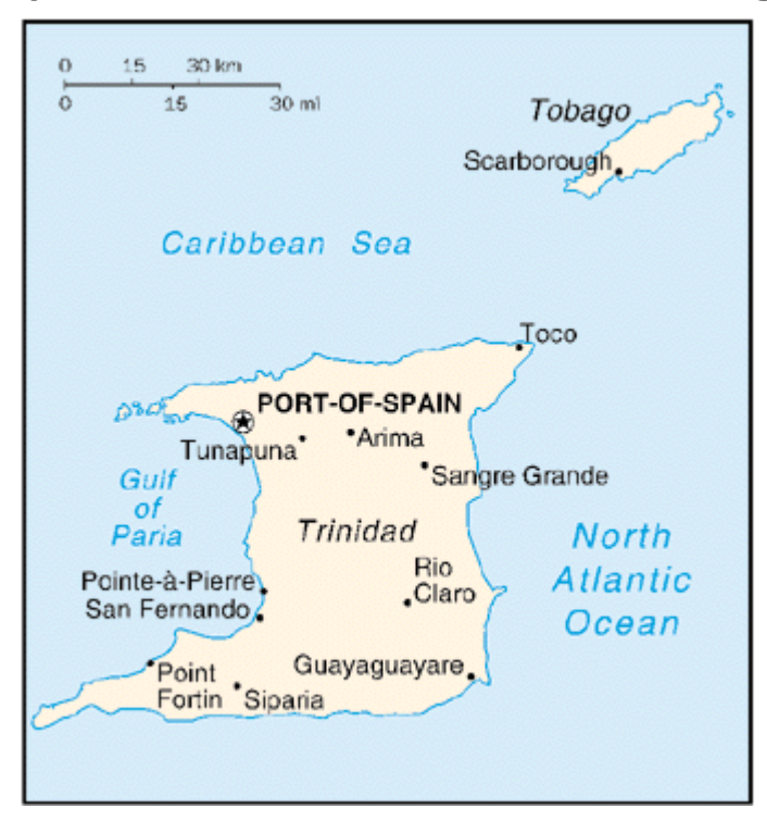
Figure 11: Map of the Republic of Trinidad & Tobago