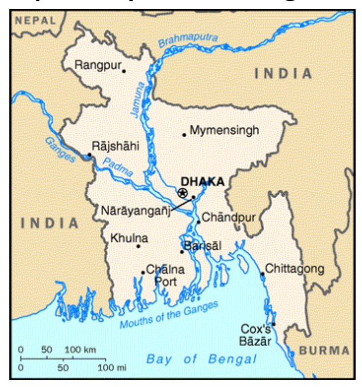
Figure 2: Map of the People's Republic of Bangladesh