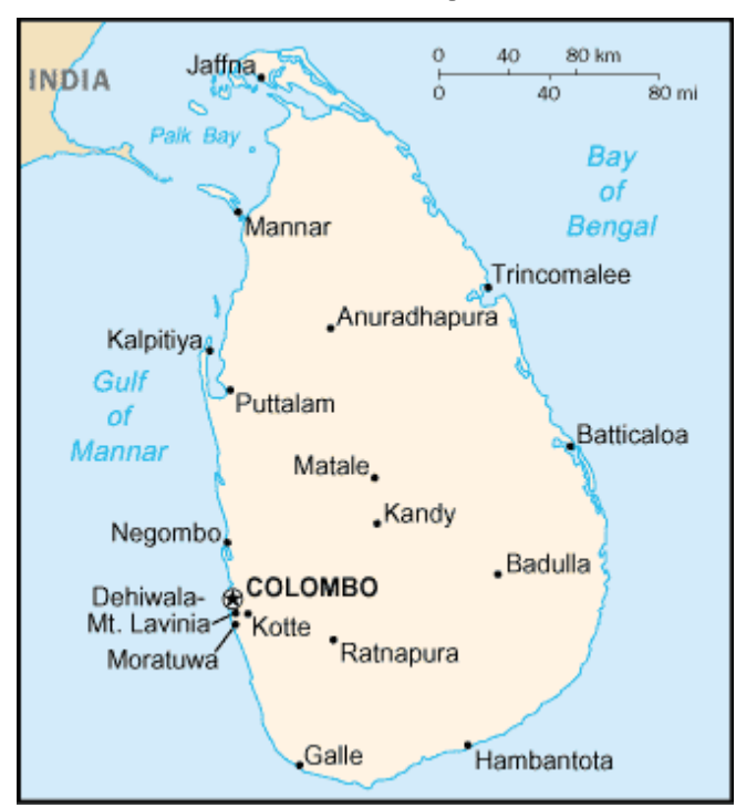
Figure 10: Map of Democratic Socialist Republic of Sri Lanka