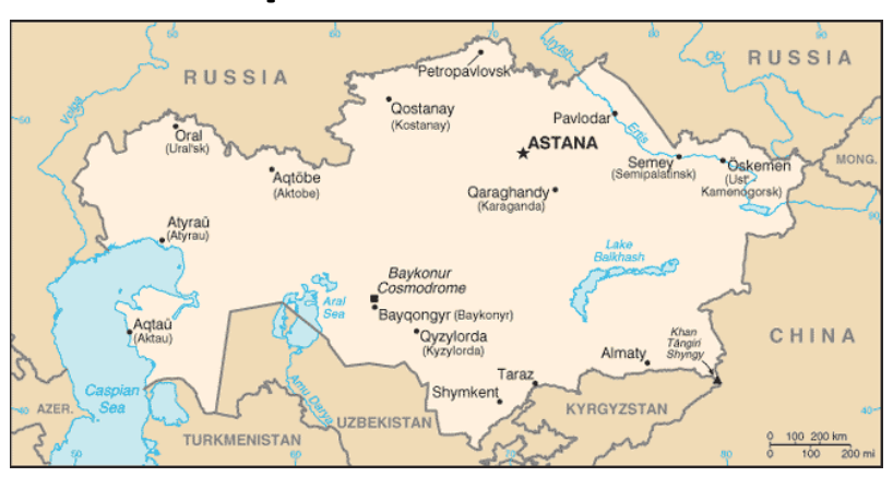
Figure 6: Map of the Republic of Kazakhstan