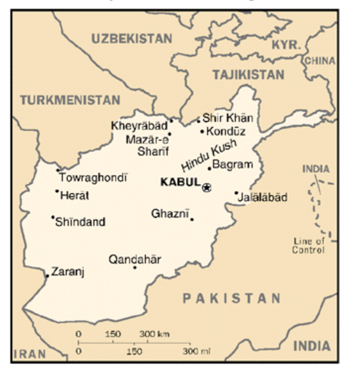
Figure 1: Map of the Islamic Republic of Afghanistan