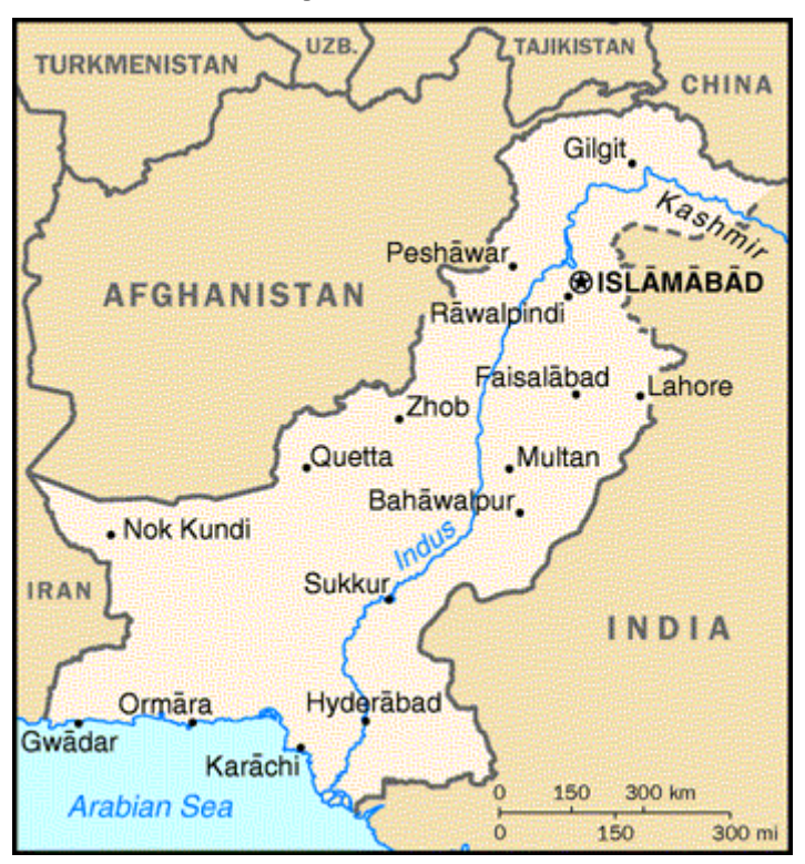
Figure 8: Map of the Islamic Republic of Pakistan